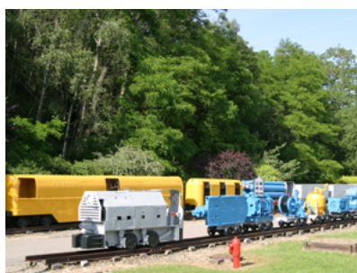
The open-air museum