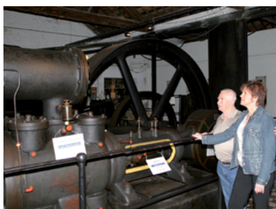
Actual view of the mining-museum (the “Pit Mary”)