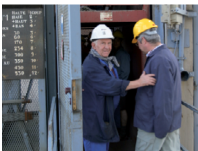
The minig cage to go down in the galleries

Since 2000 the visit in the underground galleries has been completed with a visit of the authentic coal washing and sorting buildings which have been restored accurately. It is now possible to watch the machines and systems of in-and out-caging of the trucks and to have an overview of the coal treatment process from its extraction in the galleries to the finished product ready to be transported and sold. Nothing has changed in these buildings, and certainly not the lamps which continuously light the patron saint of miners: “Sainte-Barb”. The visitors can follow the visit with the help of an audioguide in English and German.