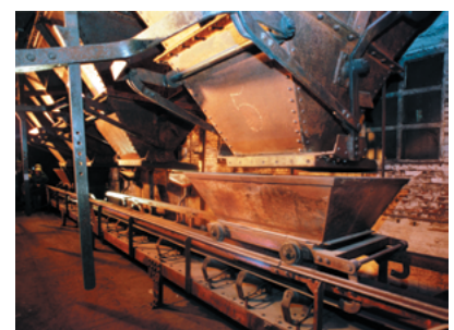
View of the coal washing and sorting building