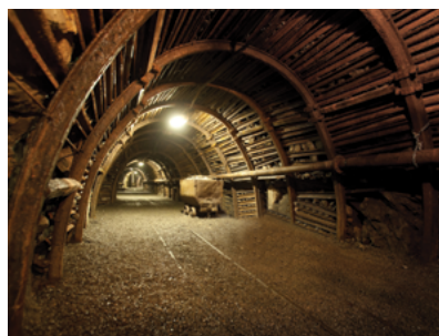
View of one of the gallery