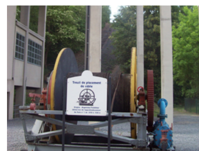
The open-air museum