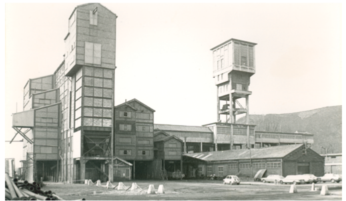
The Pit N°1 installations at the end 1970 s